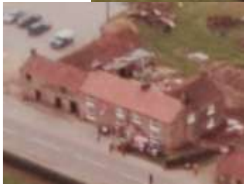
Biltsdale Agricultural Show check date